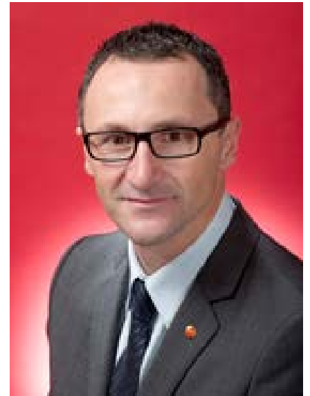
Senator Richard Di Natale