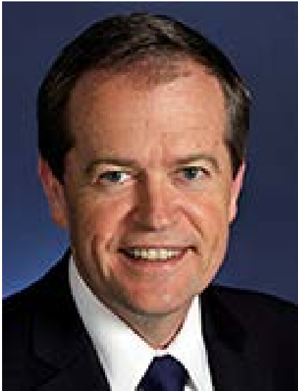
The Hon. Bill Shorten MP