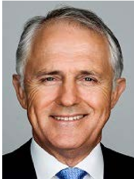
The Hon. Malcolm Turnbull MP